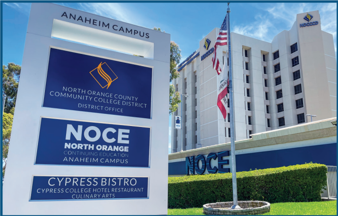
Completed Branding Signage for Exterior Signage Project - NOCE - Anaheim Campus