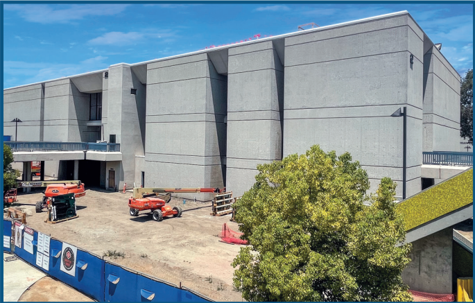
Structural and Interior Improvements at Fine Arts Renovation - Cypress College