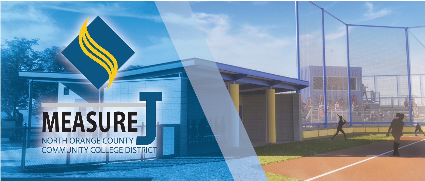
Rendering of the Future Softball Field - Cypress College